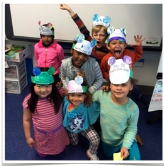
Celebrating Earth Day!

Math Journals will be sent home at the end of the year. Math boxes or journal pages that haven't been complete can be used as a review and/or preparation for fall math placement.