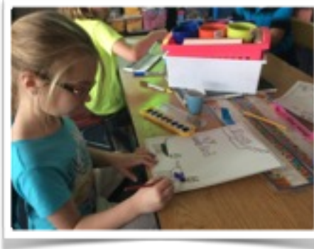
Decorating our Expert Book covers!