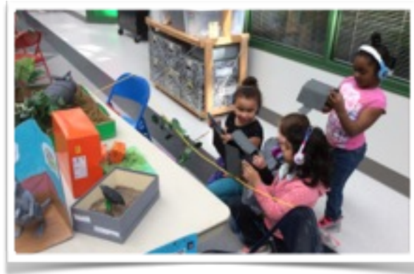
First graders visit the third grade nonfiction research extravaganza "Walk on the Wild Side"!

Report cards will be mailed home by the district.