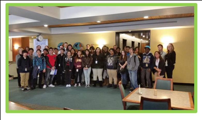
AOF students visit many businesses. This is a trip to Securian, St Paul.