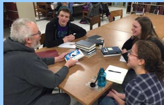
Students heading to Regional History Day had the opportunity to do research at the University of Minnesota's Wilson Library on Wednesday, February 26 th .

Fri., May 1: Better World Day and OWL Against Hunger event.