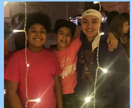
Middle schoolers smile for the camera at the winter dance on Friday, February 14 th .